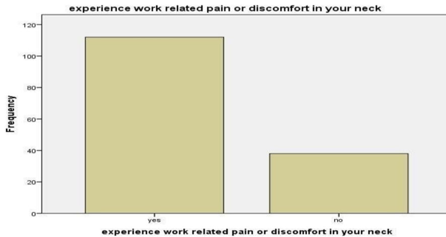
Figure 3: experience work related pain or discomfort in your neck

The respective bar chart states that frequency of experience work related pain is above 100 and the frequency of not experience work related pain is 40.